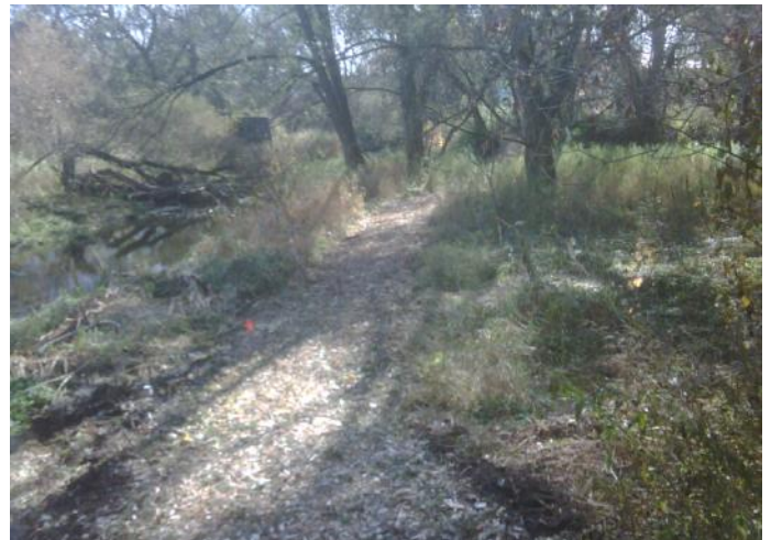
Woodchip pathway in Victoria Glen

Upwards of 50 volunteers, along with equipment (backhoe, skid steer, dump truck, wheelbarrows, rakes and shovels) and materials (armour stone rocks, granular material, trees, shrubs) supplied by Capital Paving, worked to plant 45 trees and shrubs; install 500 m of woodchips on two existing pathways through the wooded areas and install 100 meters of a 6 foot wide stone dust pathway.